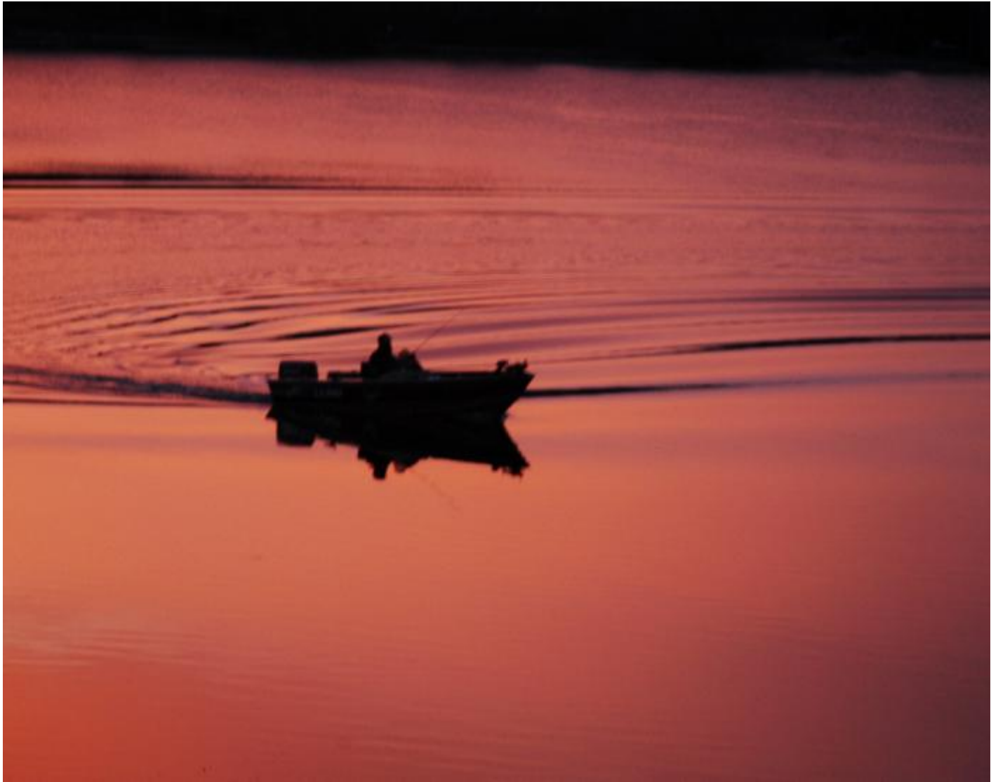
Sample Photo from my Wayzata Bay Photo Showing – Note: Color not adjusted; taken from my dock after sunset.